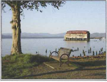
Beautiful Riverside Location