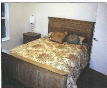
1 & 2 Bedrooms Floor Plans